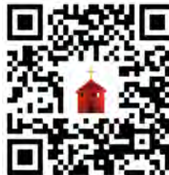
St. Leo Emergency Services Emergency Services