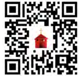
St. Leo L'Honey Program L'Honey