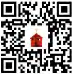
St. Leo the Great Parish Sunday Giving