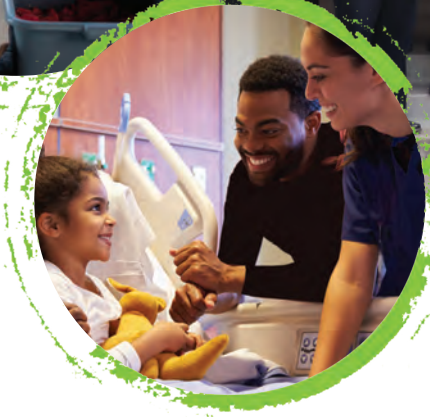
PICTURED FROM TOP LEFT: Youth Migrant Project, Seminarians, Hospital ministry

To learn about all ministries in the Archdiocese of Seattle, please review the Impact Report at archseattle.org/finance