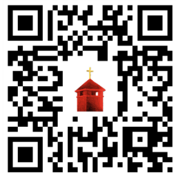
St. Leo L'Honey Program L'Honey

Scan the QR code or follow the URL to make a contribution to E-Services.