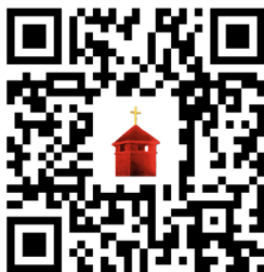
St. Leo the Great Parish Sunday Giving