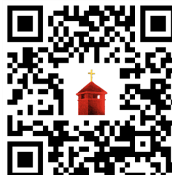
St. Leo Emergency Services Emergency Services

Scan the QR code or follow the URL to make a contribution to Food Connection