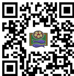
St. Leo Food Connection Food Connection

Scan the QR code or follow the URL to make a contribution to St. Leo Parish.