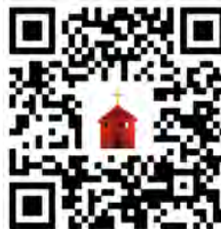
St. Leo Emergency Services Emergency Services

Scan the QR code or follow the URL to make a contribution to Food Connection