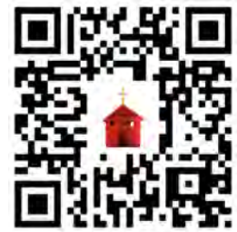
St. Leo L'Honey Program L'Honey

Scan the QR code or follow the URL to make a contribution to E-Services.