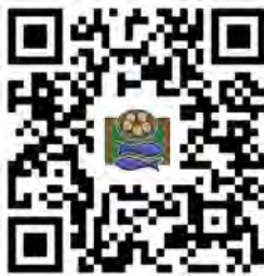
St. Leo Food Connection Food Connection

Scan the QR code or follow the URL to make a contribution to St. Leo Parish.