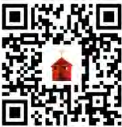
St. Leo the Great Parish Sunday Giving