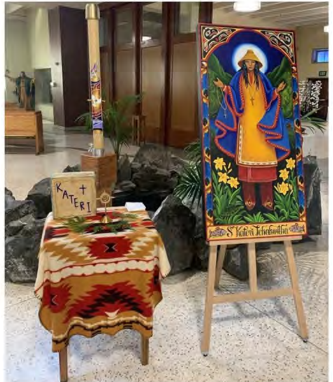
St. Kateri Relic and Icon