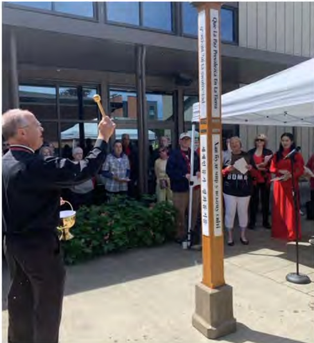
Dedication of Peace Pole at St. Leo

Please join in the Eucharistic procession to honor the Body of Christ on Sunday, June 7 th following the Noon Mass at St. Charles. Coffee and donuts will be available in the Parish Center following the procession.